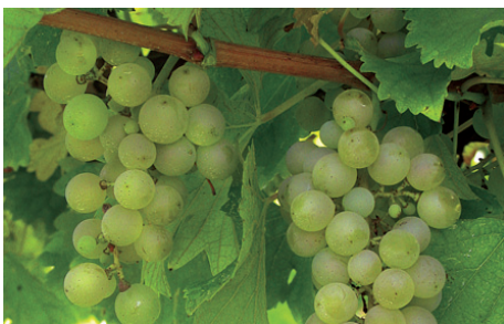
Pinot Grigio grapes