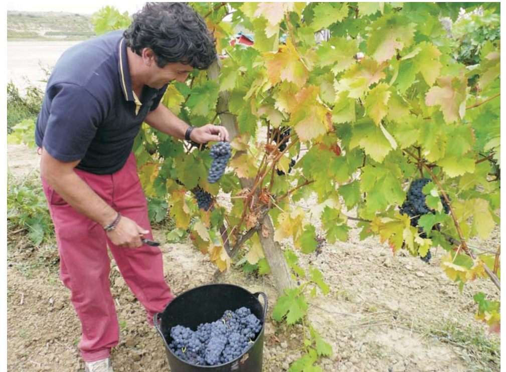
2010 harvest in Carravalseca