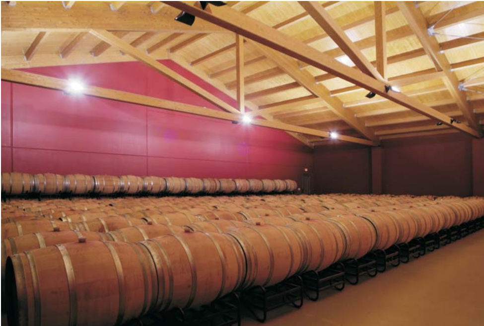
FINCAS de LANDALUCE ageing cellar