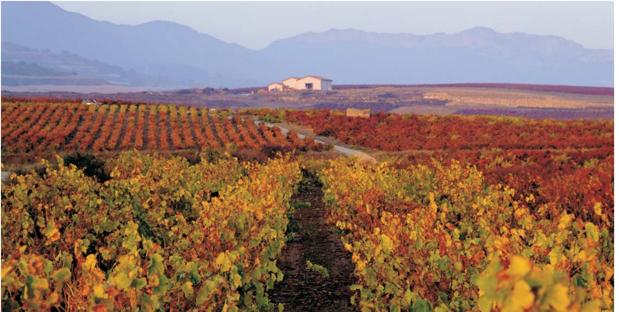
Overview of the winery from our vineyard at Fuente del Espino