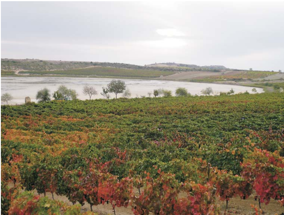
Vineyard of 1.459 hectares at Carravalseca, Laguardia. This wetland, a listed biotope, is home to up to 118 different species of migratory birds between September and March each year