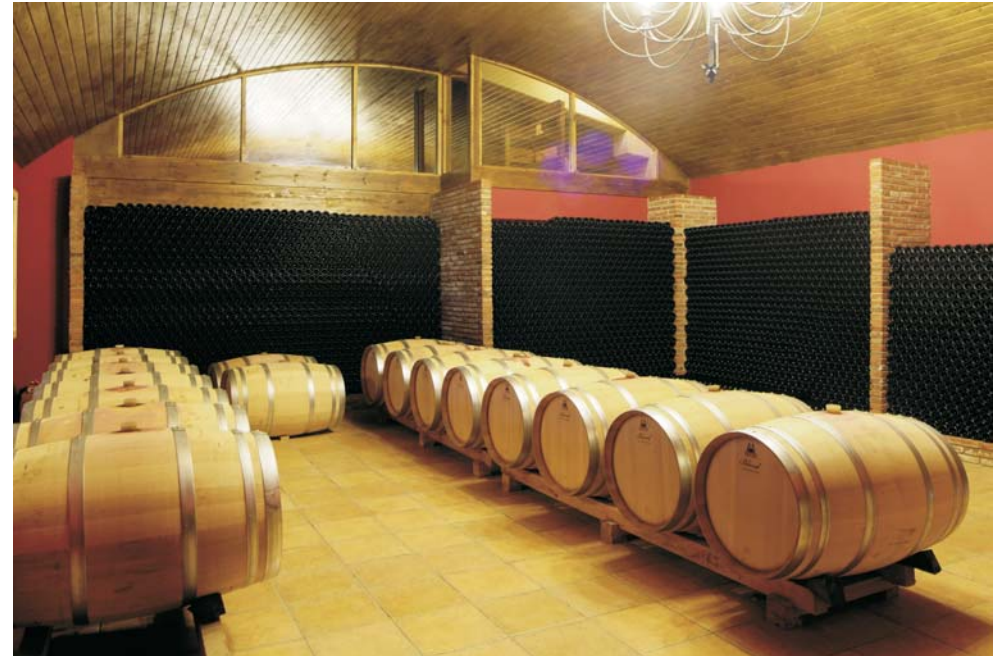
CAPRICHIO de LANDALUCE ageing and bottling cellar