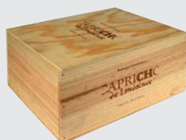
6-BOTTLE WOODEN CRATES